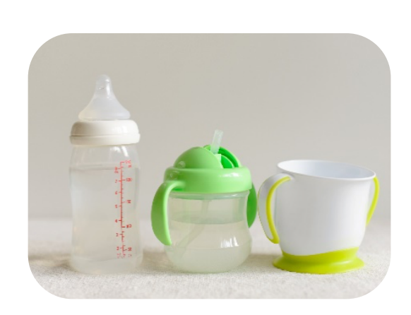
Equipment & Supplies

Families can often experience stress and anxiety as mealtime is an important part of daily life and health