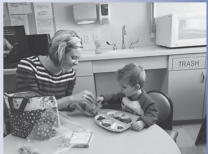
The application of behavioral interventions can be effective for managing childhood feeding disorders.

An important first step is to identify the feeding problem in order to clarify the treatment methods and objectives. Behavioral treatment strategies are the mainstay for the management of feeding disorders and are designed to reinforce positive behaviors and minimize maladaptive behaviors. These strategies include a combination of modifications of mealtime scheduling,